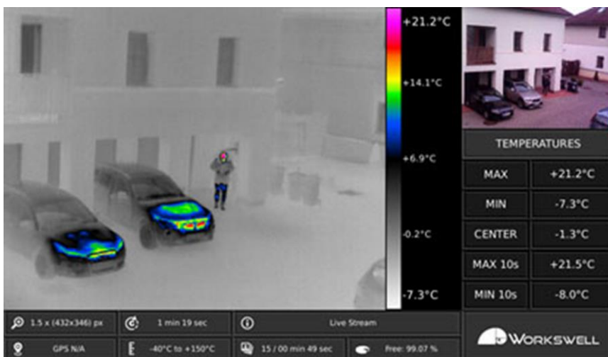
Car engines are kept ticking over meaning they can be quickly started in a short time.

Today, security is an expression that is very sensitively used in all areas of our lives. Security measures, security risks, security cameras, etc. ensuring the security of loved ones, staff, the city's population, animals and objects is a priority for most of us. It is not easy task and, unfortunately, is not something that can be resolved forever. We will always have to resolve it again and again, because new security risks will always arise. The most frequent source of fear is the risk of entry by undesirable people (or animals) into buildings and onto land. An analogical problem is the search for missing persons in particular areas. Searching from missing persons in an open area during the day is not usually problematic although conditions are not always ideal — fog may appear or the area may be intentionally smoked out. The cycle of the time and day play against us and intruders usually operate under the cover of darkness.